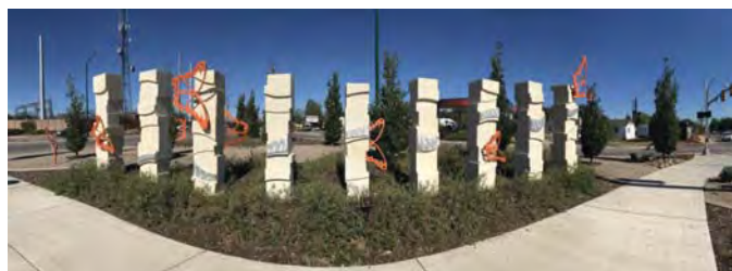
Regional Active Transportation Plan