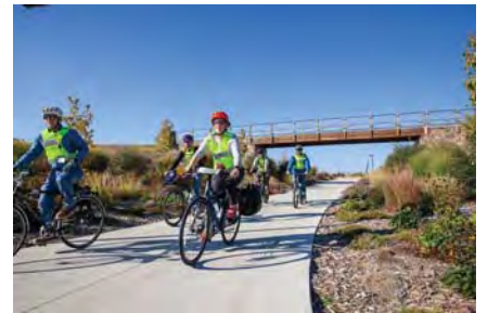
Regional Active Transportation Plan