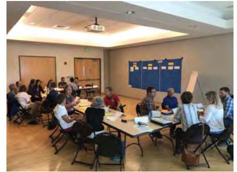
Regional Active Transportation Plan