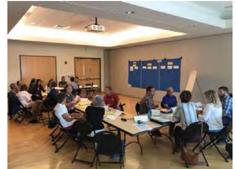
Regional Active Transportation Plan