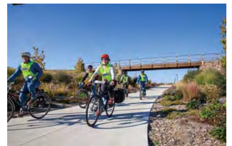
Regional Active Transportation Plan