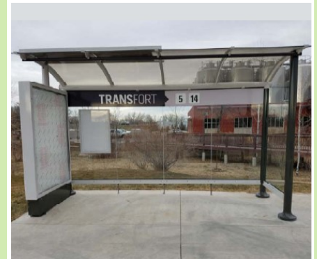
Upgraded Bus Stop—Transfort

The City of Fort Collins-Transfort was successful in receiving a Federal Transit Administration (FTA) $5339 Bus & Bus Facilities Infrastructure Investment Program grant to upgrade bus