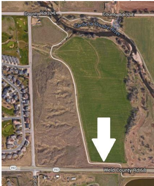
Larimer County: River Bluffs Open Space